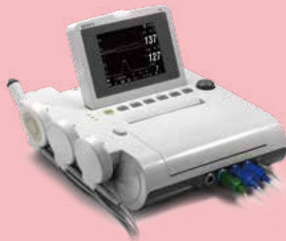
F2 Fetal Monitor